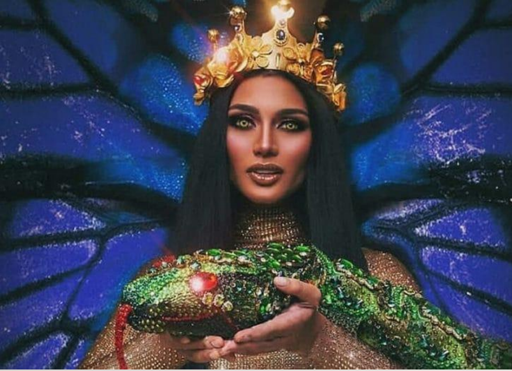
MARIA LIONZA FROM VENEZUELA