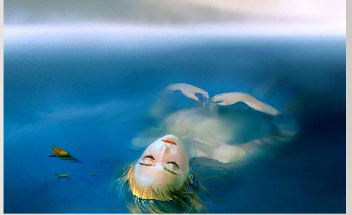
MADRE DE AGUA FROM COLOMBIA